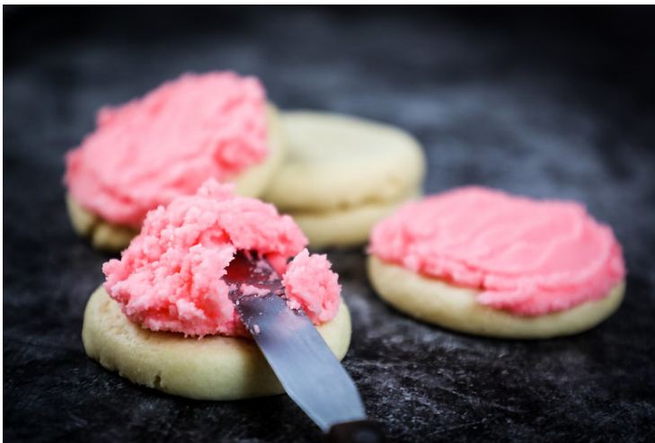
Pink Buttercream shown on baked sugar cookie